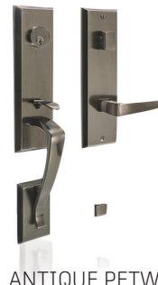
ANTIQUE PETWER (SHOWN WITH INTERIOR TRIM)